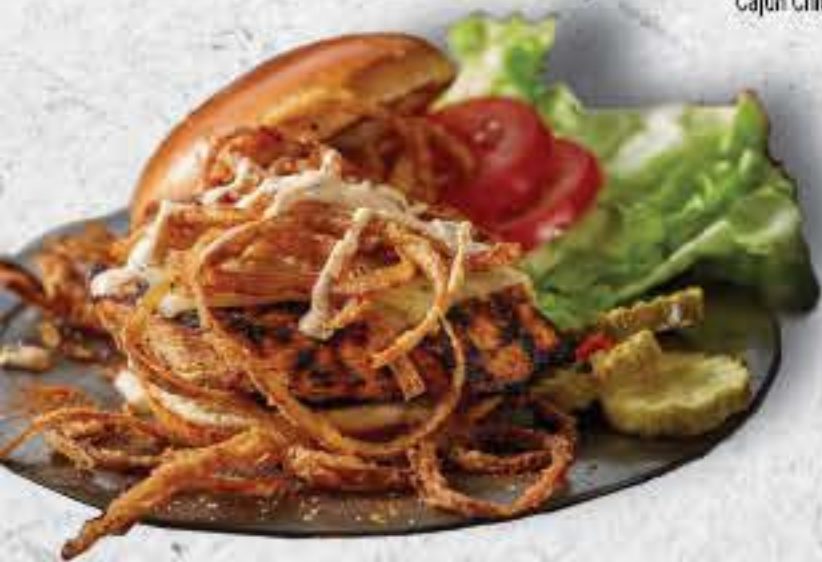
Cajun Chicken Sandwich

★ ADD A CUP OF CHILI OR SIDE SALAD $4.95