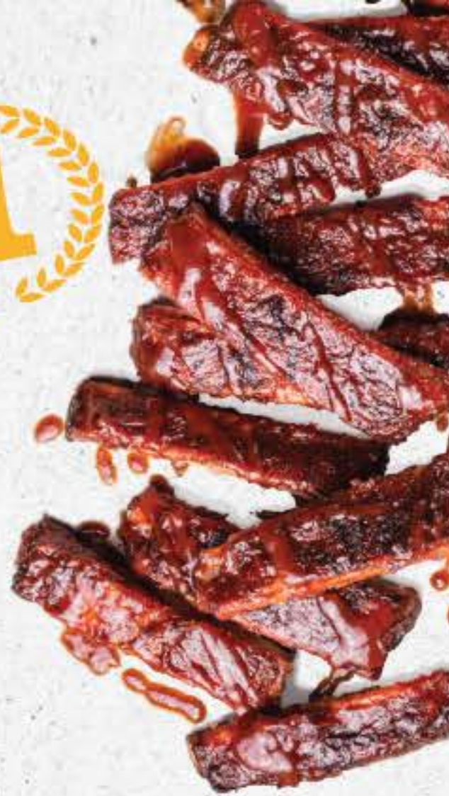
St. Louis-Style Spare Ribs

4 Bones (630 Cal.) 6 Bones (690 Cal.) 8 Bones (1410 Cal.) 12 Bones (1890 Cal.) $22.95 $29.95 $33.95 $37.95