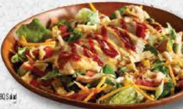
Dave's Sassy BBQ Salad