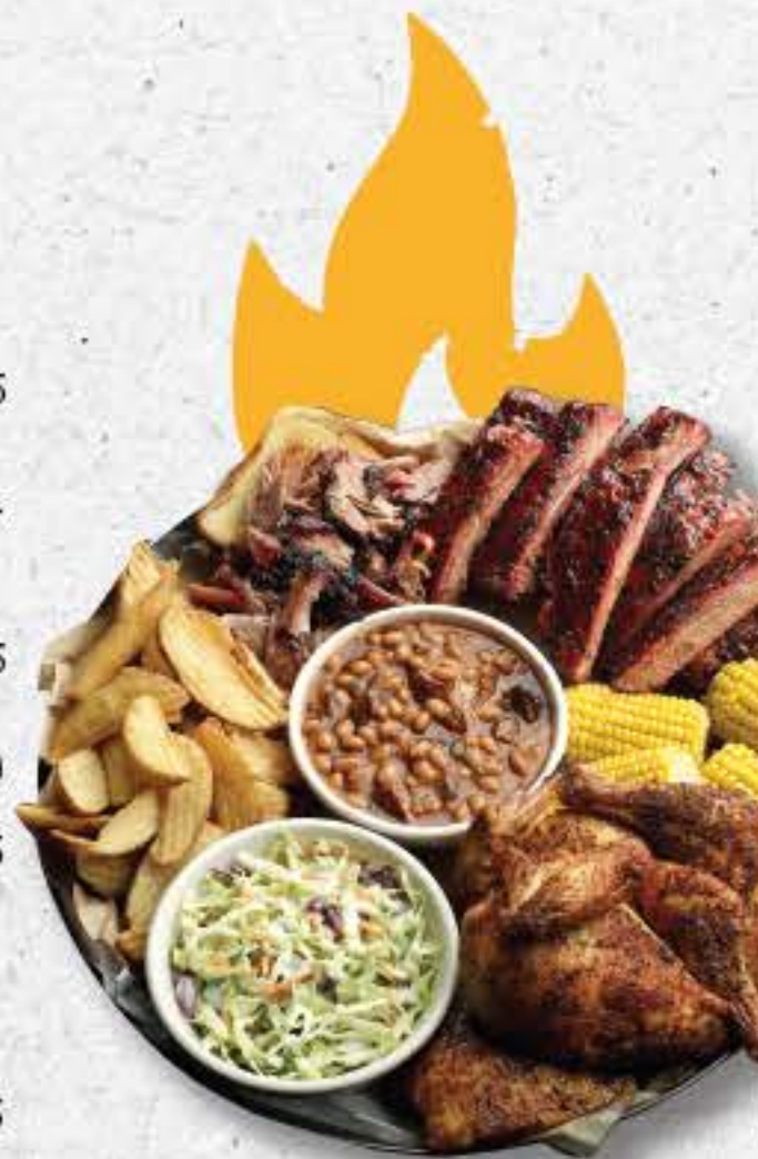
All-American BBQ Feast*

FOUNDER'S FEAST $32.95 Georgia Chopped Pork, 1/4 Country Roasted or BBQ Chicken, 3 St. Louis-Style Spare Ribs, Sweet Corn, Wilbur Beans, Creamy Coleslaw and Famous Fries. (2260-2330 Cal.)