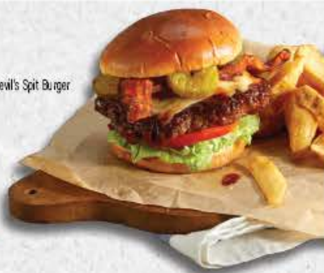
Devil's Spit Burger

ULTIMATE $17.95 Piled high with Georgia Chopped Pork, bacon, Cheddar Cheese and Sweet & Zesty BBQ Sauce*. (1020 Cal.)