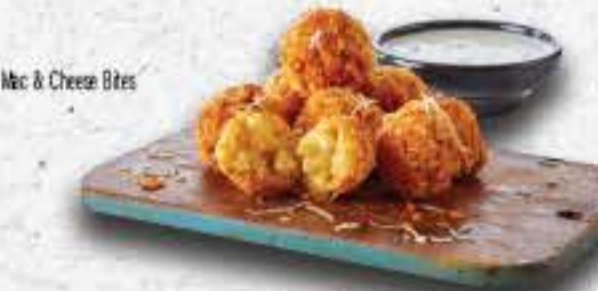
Mac & Cheese Bites

MOZZARELLA STICKS $9.95 Everyone loves these breaded mozzarella sticks served with classic marinara sauce. (1040 Cal.)